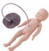
B Fetus For Demonstration