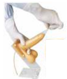
Size : 29cm x 20cm x 13cm G.W.: 0.7kg