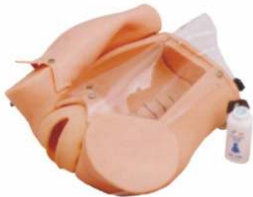
A Matrix For Delivery Demonstration