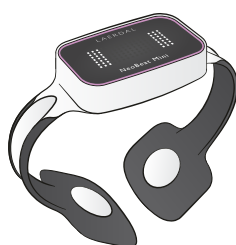
NeoBeat Mini 531-00000