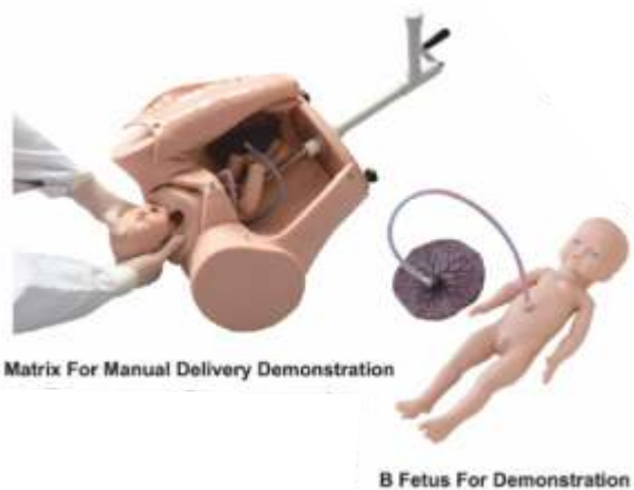
C Matrix For Manual Delivery Demonstration