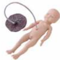
B Fetus For Demonstration